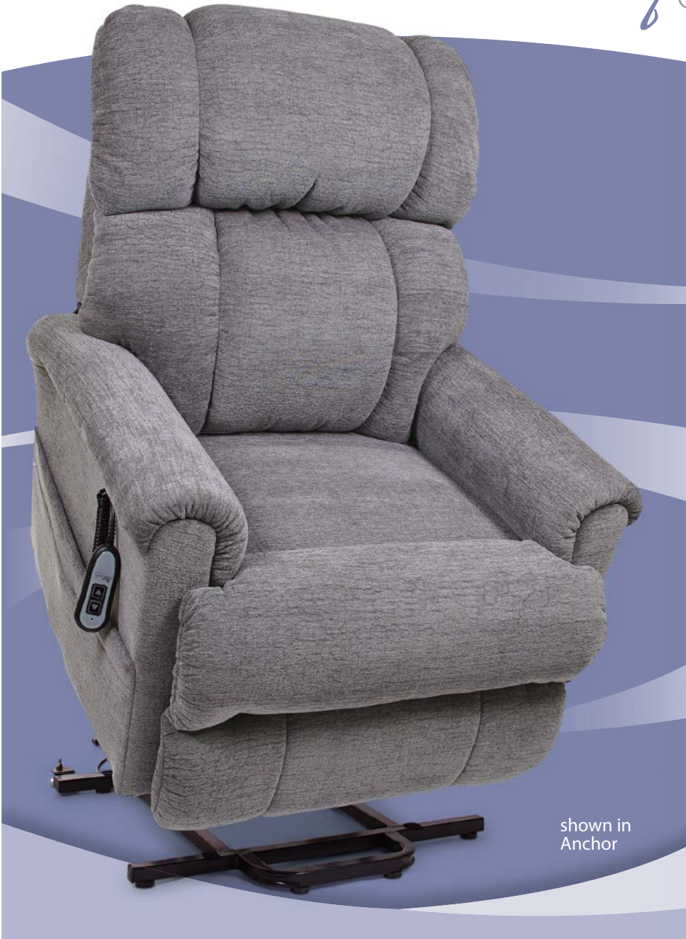
shown in Anchor